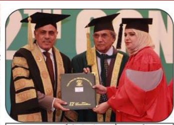
گورنر پنجاب محمد رفیق رحمانہ طالبہ کو پی ایچ ڈی کی ڈگری دے رہے ہیں

کامیابی کے لیے اس کی ضرورت ہے کہ وہ اپنے آپ کو بہتر بنائے۔ اس کے لیے اس کو اپنی زندگی میں تبدیلی لانی چاہیے۔ اس کے لیے اس کو اپنی زندگی میں تبدیلی لانی چاہیے۔ اس کے لیے اس کو اپنی زندگی میں تبدیلی لانی چاہیے۔