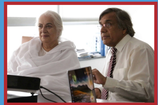
Provincial Minister for Higher Education Begum Zakia Shahnawaz Visted PHEC