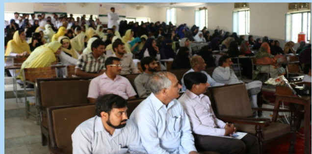
Participants attending the seminar

appropriate use of SPSS and other methodological tools is necessary to get an objective understanding of research problems.