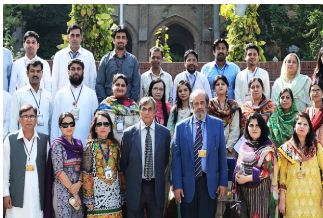
A group photo of Chairperson PHEC with participants of faculty training program at GCU Lahore.