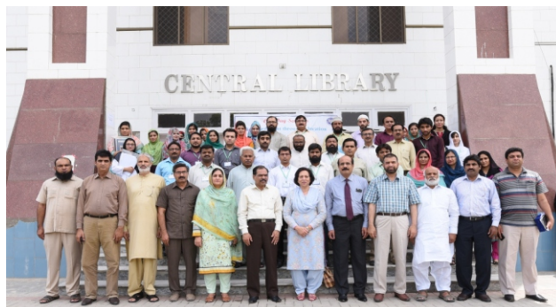
A group photo of participants at the seminar

The participants applauded the efforts of PHEC for taking this initiative for promoting research. PHEC hopes that the seminar significantly contributed to the understanding of epistemological foundations of qualitative research, as it provided a platform for teachers and students to enhance their exposure.