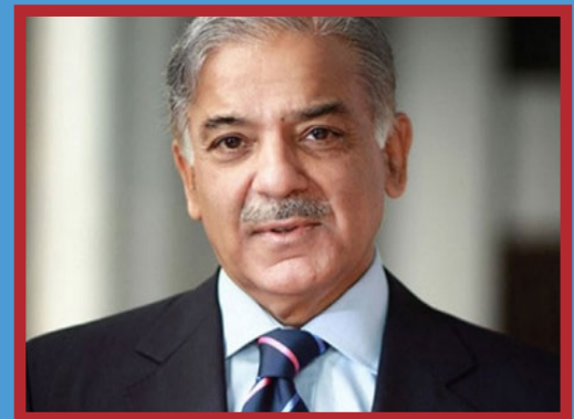
Chief Minister Outlines PHEC's Agenda