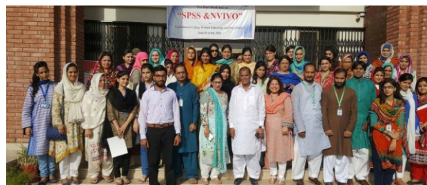
A group photo of participants at the workshop

research techniques for self-development. Modern research methods form the essential rivets in equipping researchers to make the research more accurate and precise in terms of research outcomes.