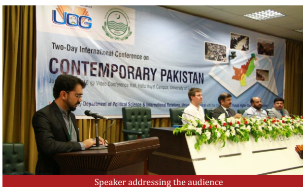
Speaker addressing the audience

A two-day international conference on “Contemporary Pakistan” was organized at University of Gujrat (UoG) in collaboration with Punjab Higher Education Commission (PHEC) from 2 nd June to 3 rd June 2016. The aim of the conference was to find sustainable solutions to Pakistan's internal as well as external problems within the current international scenario.