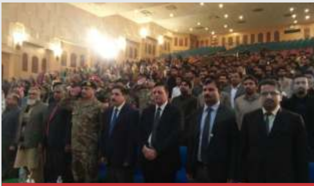
Guests & participants standing in respect of the National Anthem

A seminar was organized by PHEC in collaboration with the working group at Bahauddin Zakarya University (BZU) Multan on December 26, 2016.