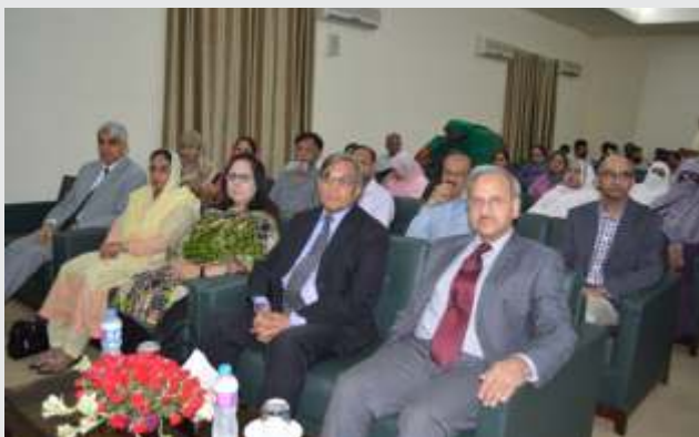
The Chairperson PHEC at the closing ceremony

The training session took place from 3 rd October to 7 th October 2016 at the Bahauddin Zakariya University (BZU) Multan. The Quality Enhancement Directorate of BZU Multan organized this workshop in collaboration with PHEC for college Principals/DDOs. The topic of the training program was "Governance, Finance & Audit". 43 Principals/DDOs participated in this workshop from all the government colleges of various districts of Punjab.