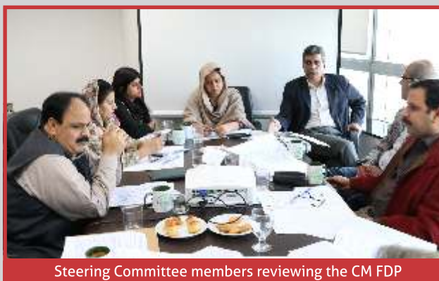
Steering Committee members reviewing the CM FDP

approved funding for tuition fee, settlement allowance, medical allowance, research/book allowance, stipend and airfare for timely disbursement to each scholar.