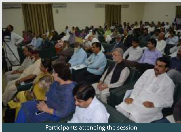
Participants attending the session

He was of the view that these training programmes would help develop a good governance mechanism at colleges. He further stated that the area and scope of these training programs would improve future outcomes.