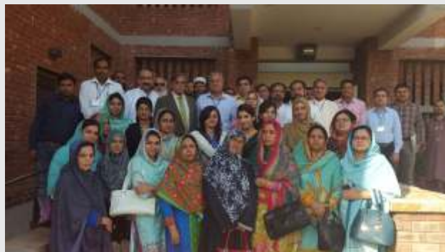
A group photo of the participants with Chairperson PHEC