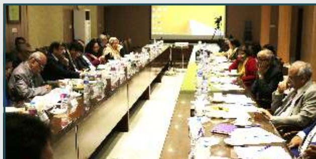
The Vice Chancellors participating in the meeting

The VCs appreciated the efforts of the Government of Punjab and PHEC for bringing everyone together on one common platform. The VCs presented a detailed briefing about their universities' working.