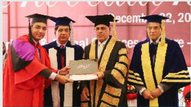
The Governor of Punjab conferring degrees to graduates

Addressing the convocation, the Governor congratulated the graduating students on getting their degrees and medals. The Governor and the Chairperson PHEC along with the Vice-Chancellor of UVAS distributed degrees to PhD scholars and medals to the position-holding graduates.