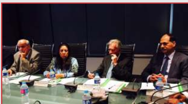
Commission members present at the meeting

The Commission also decided to constitute an Assessment Committee for an evaluation of M.Phil./Ph.D. programmes being offered by the private sector DAIs/Universities to ensure standardization of education in the province of Punjab. The Commission further decided to strengthen the monitoring and evaluation programme of all DAIs.