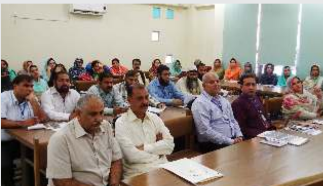
PHEC's directors, principals and faculty members at the workshop