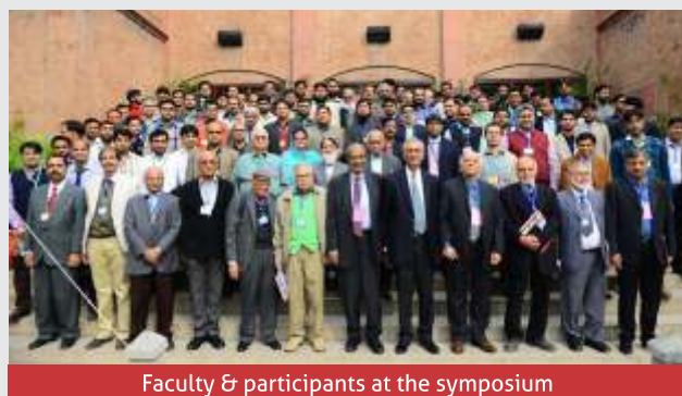
Faculty & participants at the symposium