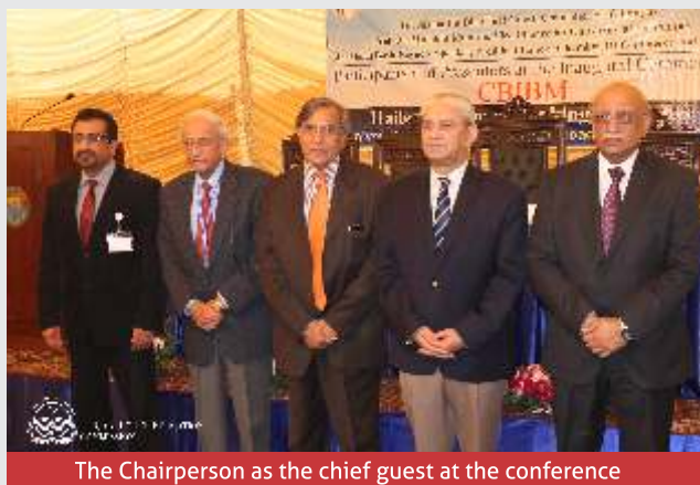
The Chairperson as the chief guest at the conference

He added, "We cannot derive benefit from the China-Pakistan Economic Corridor (CPEC) project unless we produce ample human resource in every sector in the country through higher education."