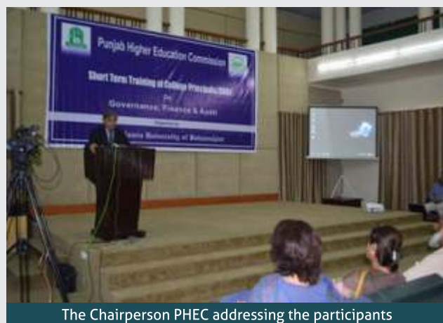
The Chairperson PHEC addressing the participants

Financial training is an integral part of the training program. Financial and firm administrative practices for governance are essential for the smooth running of an academic institution. The first three days of the training were spent on the financial streamlining of colleges.