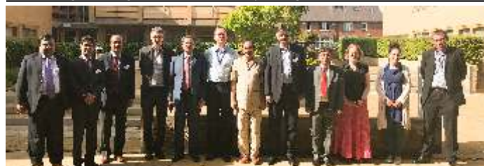
Participants of the training along-with University of Leicester officials