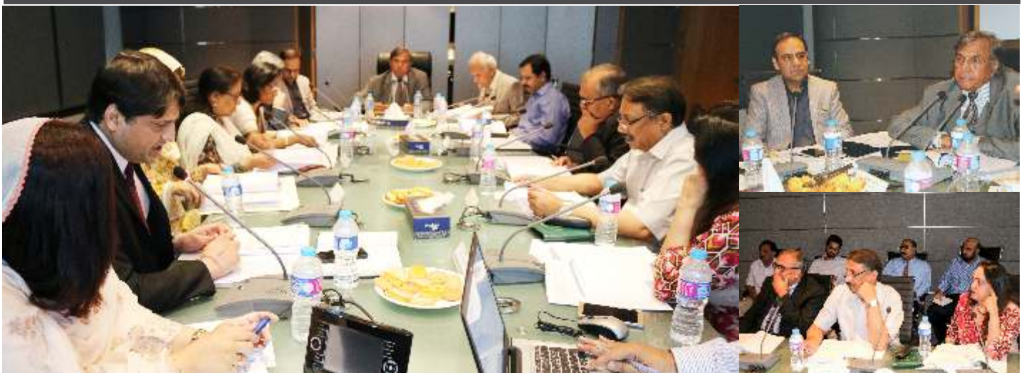
The 9th meeting of the Punjab Higher Education Commission was convened at the PHEC Secretariat