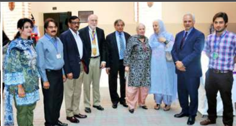
The Chairperson PHEC at the Aging Conference in FC College