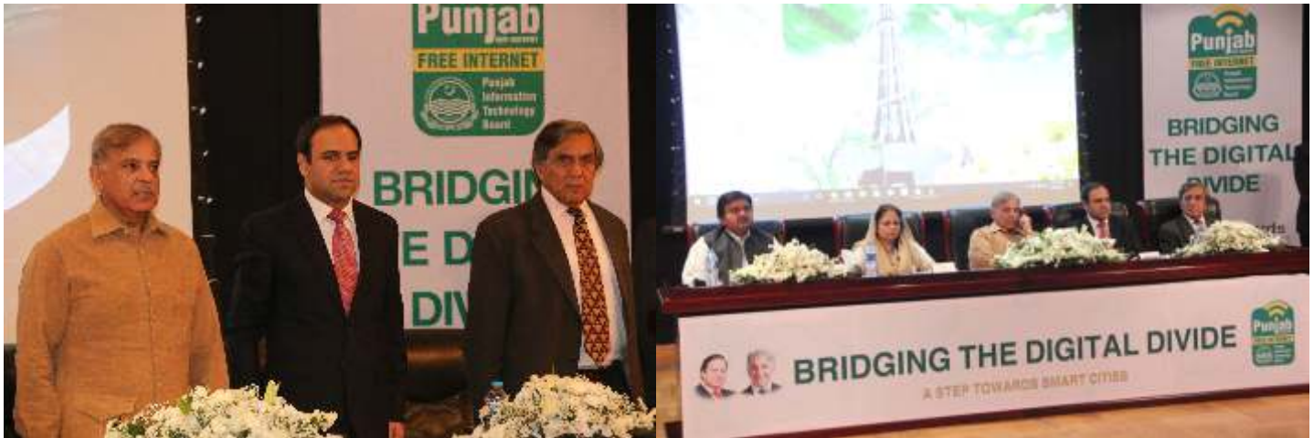
The Chief Minister of Punjab Muhammad Shehbaz Sharif inaugurated free WiFi service in Punjab