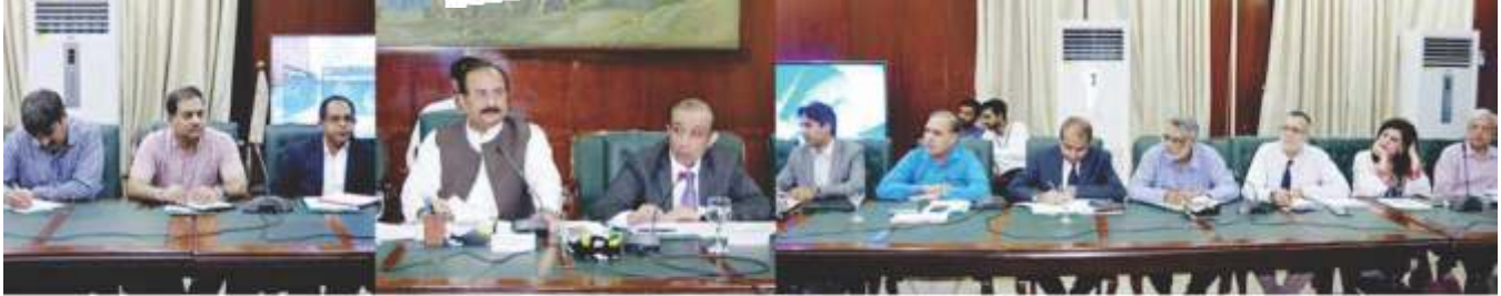
صوبائی وزیر سکولز ایجوکیشن رانا شہود احمد خاں صوبے بھر میں ٹیکنیکل تعلیم کی فروغ کے حوالے سے اجلاس کی صدارت کر رہے ہیں۔ (لاہور 19 جولائی 2017ء)