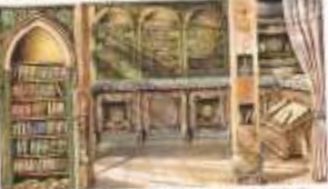
LIBERAL ARTS: An illustration of a library in a building in Islamabad.

LAHORE: Punjab Higher Education Commission (PHEC) Chairperson Prof Dr Nizamuddin said that it is not only the liberal arts but also the sciences that equip students to become useful individuals.