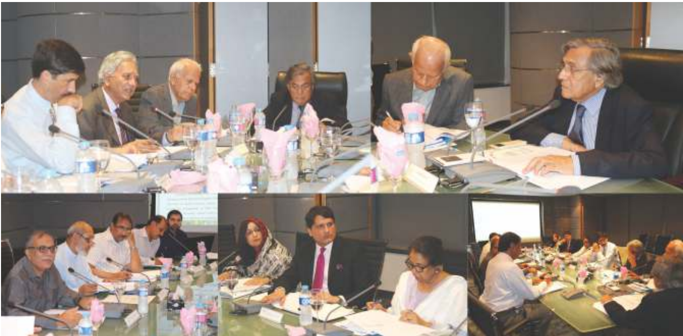
The 10 th meeting of the PHEC Commission held at the PHEC Secretariat.