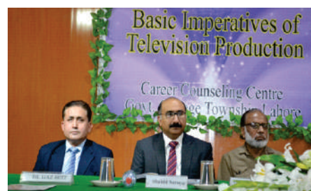
Community College Seminar on: "Basic Imperatives of TV Production" at GCT, Lahore