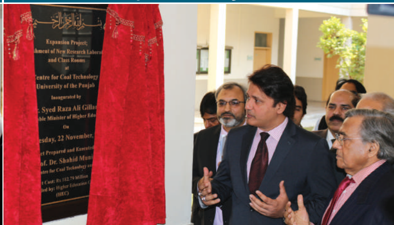
Minister for Higher Education Punjab and Chairperson PHEC inaugurated the Center for Coal Technology at the Punjab University, Lahore.