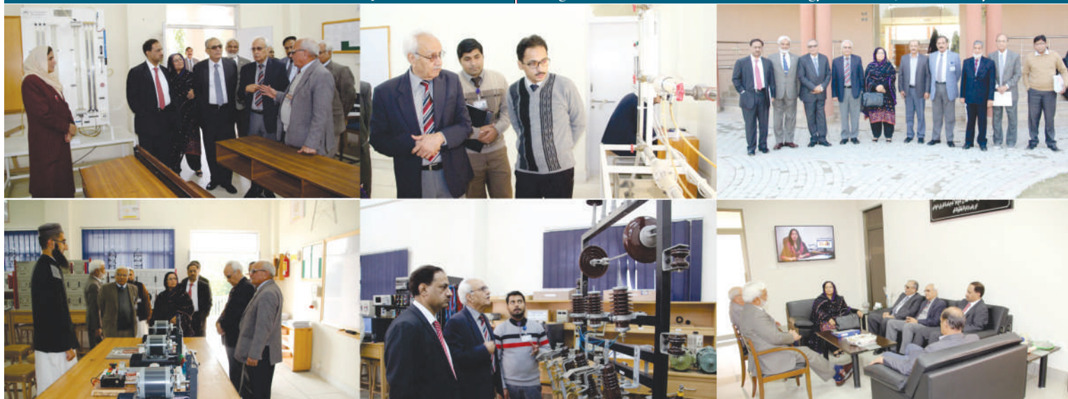
Members of Accreditation Committee of PHEC visit University of Wah, Wah Cantt