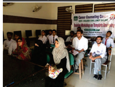
Workshop on "Template Designing" at Govt. College Civil Lines Multan