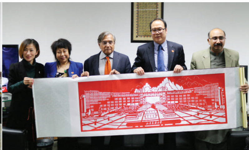
Chinese delegation from Shandong Jianzhu University presented mural to Chairperson PHEC during their visit to PHEC