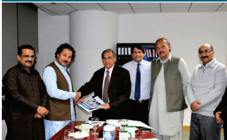
President of Federation of All Pakistan Universities Academic Staff Association (FAPUASA) met Chairperson PHEC