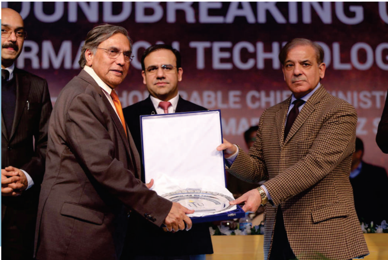
Chief Minister of Punjab Muhammad Shehbaz Sharif presenting a memento to Chairperson PHEC at the ground breaking ceremony of ITU Main Campus Barki Road, Lahore

Volume: 02 Issue: 04 October-December 2017