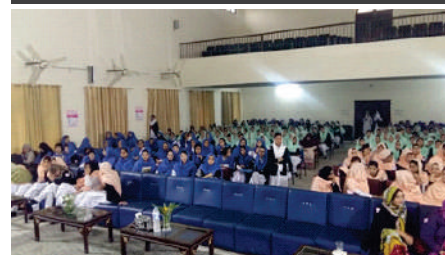
Orientation session of Associate Degree academic at Govt. College for Women Gujranwala