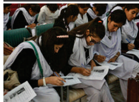
Workshop for Associate Degree in Mass Comm. Students Govt. College For Women Faisalabad