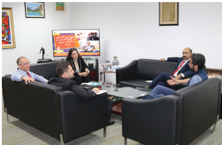
A delegation from University of Bristol, UK visited PHEC