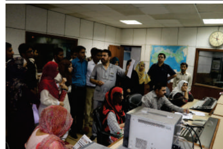
Community College students visit PTV Station Lahore