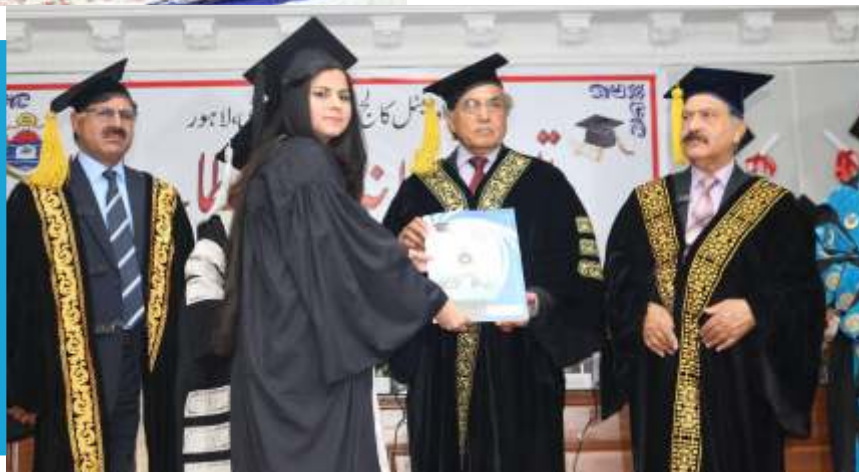
Chairperson PHEC attended the 3 rd Convocation of the University of the Punjab Old Campus, Lahore