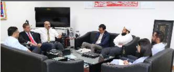
A meeting between PHEC and Oxford University Press (OUP) Pakistan was held to discuss an upcoming initiative of PHEC regarding Text Books and Monographs writing.