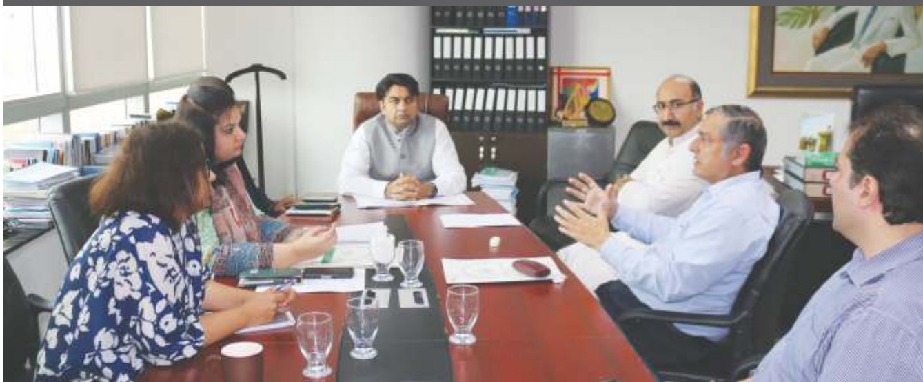
Minister for Higher Education Raja Yassir Humayun Sarfraz presiding over a meeting at PHEC Secretariat, Lahore