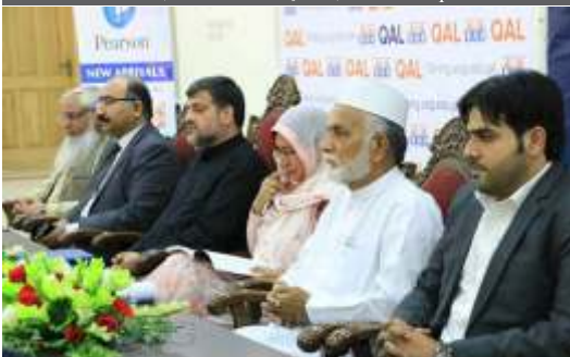
An "Anti-Piracy Campaign in Punjab" jointly organized by the, PHEC, UoG and Pearsons publications