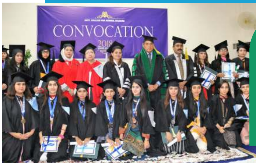
Chairperson PHEC attended the convocation of Gulberg College for Women, Lahore as chief guest.