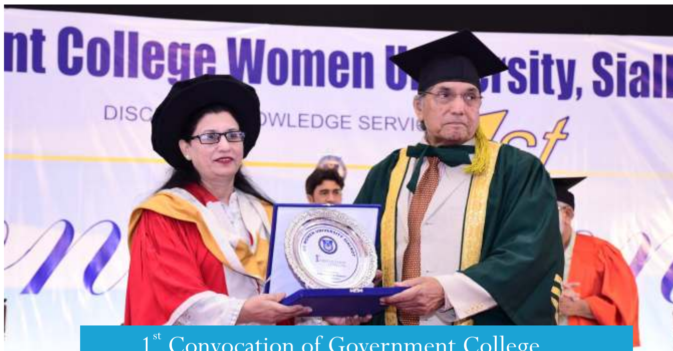
1 st Convocation of Government College Women University, Sialkot