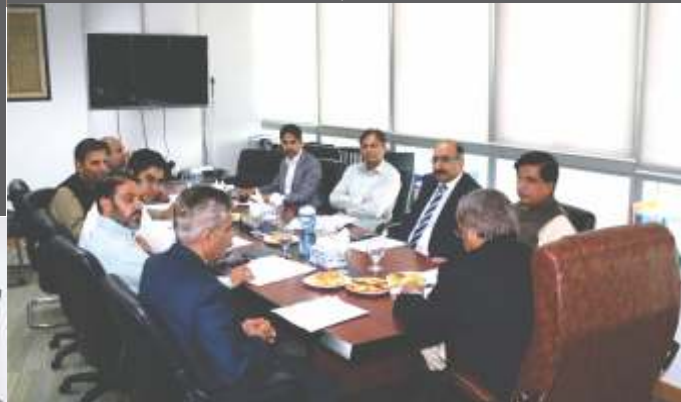
Chairperson PHEC presided over a Committee meeting of Punjab Tianjin University of Technology (PTUT)