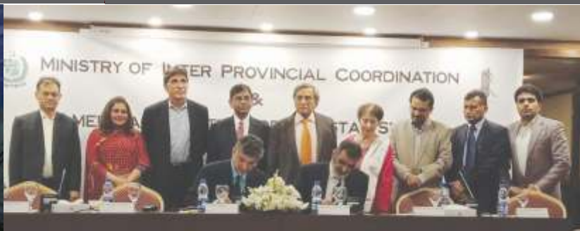
The Chairperson PHEC while attending a MOU ceremony between the Ministry of Inter-Provincial Coordination and American Institute of Pakistan Studies (AIPS)