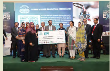
Bio Keratin powder extraction Lahore Garrison University, Lahore