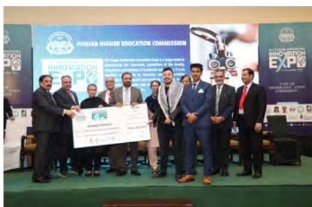
Celestial Objects' Seeker and Tracker University of Engineering & Technology Taxila