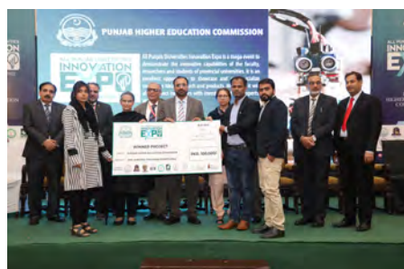
TALEEM Consultancy GC University Lahore