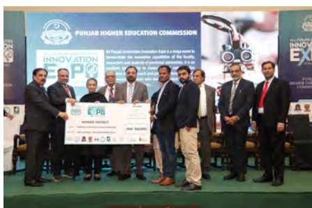
Organic cosmetics Chemical free organic skin products Eco Pads Biodegradable sanitary pads Shampoo pods Biodegradable pods (replacement for plastic) GC University Lahore