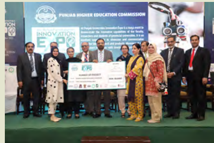
Community-based Solid Waste Management through Active and Effective Participation Fatima Jinnah Women University, Rawalpindi