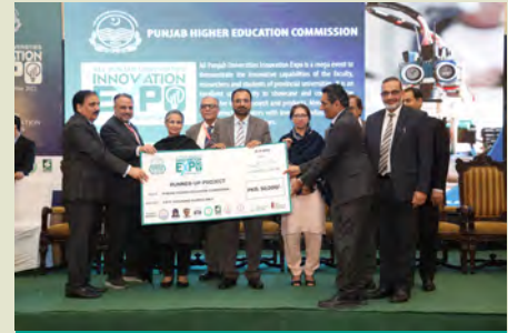
Sign Language Interpreter University of Central Punjab