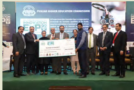
Fetus Heart Rate Monitoring University of Engineering & Technology, Lahore