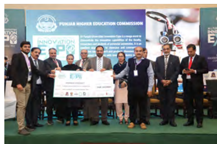
Development of Austempered Ductile Iron (ADI) University of the Punjab