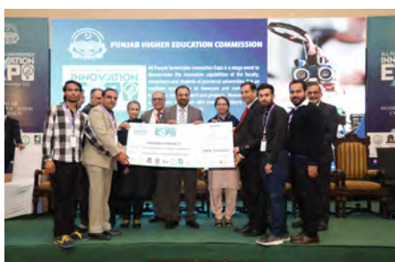
Free Guy Computer Science KFUEIT, Rahim Yar Khan