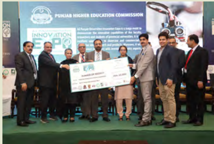
Portable Water Monitoring System University of Agriculture, Faisalabad