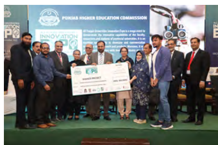
Cloning, Expression and Characterization of Bacterial L-Asparaginases for Applications in Cancer Treatment and Food Industry Islamia University, Bahawalpur