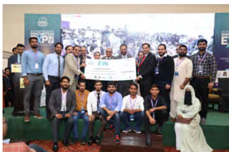
Plastic Pyrolysis KFUEIT, Rahim Yar Khan