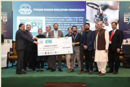
Ugo: An Audio-Visual Signal Processing Tool to Improve the Communication and Presentation Skills University of Engineering & Technology Taxila