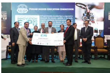
Development and Assessment of Automatic Irrigation System KFUEIT, Rahim Yar Khan