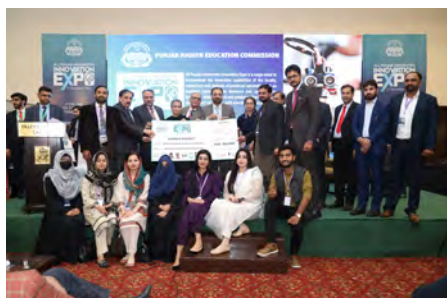
Open burning vs efficient management of agriculture residues Mitigation of winter SMOG (carbon emission) due to open burning of rice straw University of Jhang