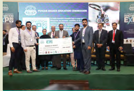
Effect of Heat Treatment on Microstructure and Properties of Nickel Based Superalloys University of the Punjab