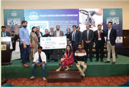
Organic Crocks Ragrant Bio Refinery Bahaudin Zakriya Univresity Multan